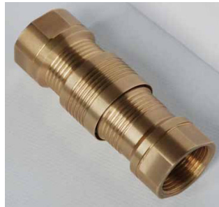
1" Hose Quick Coupling Designed for easy connection and to minimise resistance of high flow rates. Suitable for fuel, oil, water, etc