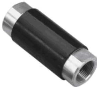
Breakaway Valve BA1 1" Breakaway BA1-HR Reconnectable 1" breakaway connection designed to separate when subjected to a force while limiting any fuel spill. A valve on each half of the coupling closes preventing leaks.