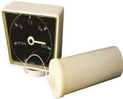
Tank Gauge AT/D1600 Float gauge to suit oil tanks.