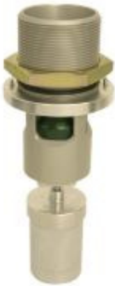
Over Fill Protection RTTI50MM Over fill protection valve. c/w 2" BSP parallel thread.