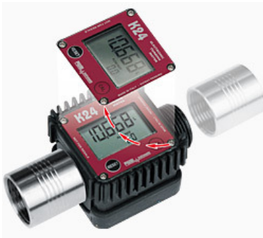
K24 F00407010 Inline turbine digital meter c/w 1" female ports, reinforced polyamide body and flow rate indication.