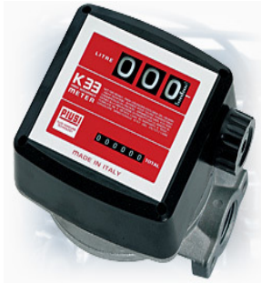
K33 000550 3 digit meter. Can be used with or without pump