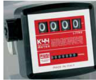
K44 000560 4 digit meter. Can be used with or without pump