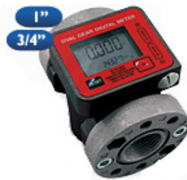
K600 F00496A0 Digital oval gear meter c/w 1" female ports and accuracy of +/- 0.5%