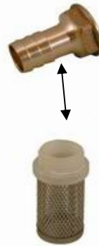
RA0025 1" Hose Filter RA0020 3/4" Hose Filter