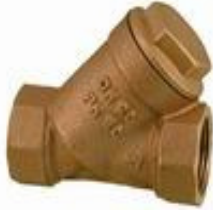
RA411020 3/4" Brass filter RA411025 1" Brass filter